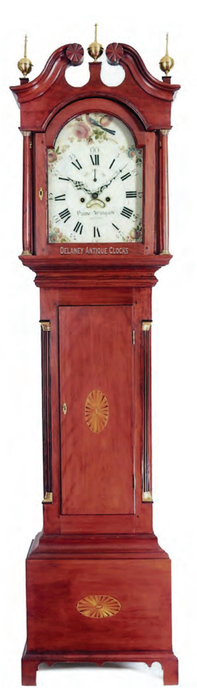
Figure 6. Paine Wingate tall case clock, signed from Haverhill, MA.