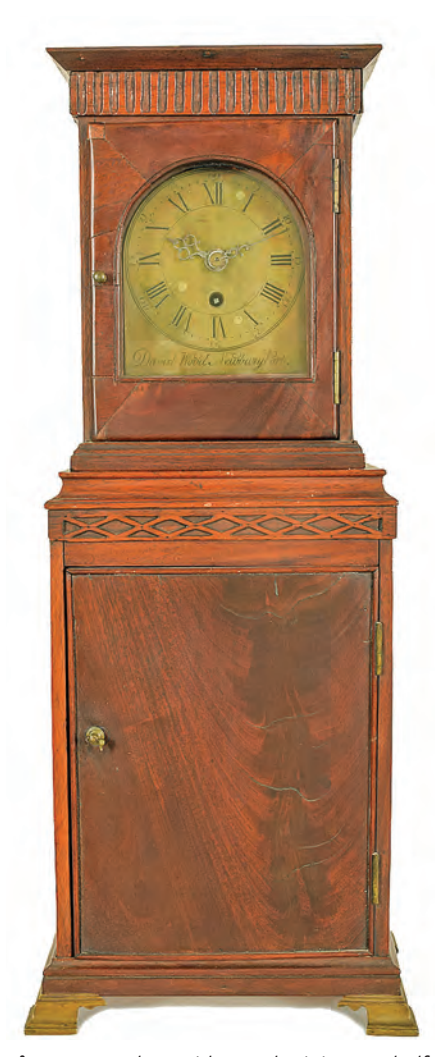
Figure 4. Early David Wood miniature shelf clock (24" tall at the feet and 9\frac{3}{4} " wide and 6" deep, and brass dial 4\frac{5}{8} " across).

As for the dénouement of the Mulliken v. Wingate case, when the Massachusetts Supreme Court met on December 16, 1788, it appeared to the judges that the appellant had "discontinued his suit"—did he not show?—and they awarded the appellee 15 pounds, 2 shillings, and 4 pence in costs. <sup>59</sup> Nevertheless, William Wingate apparently