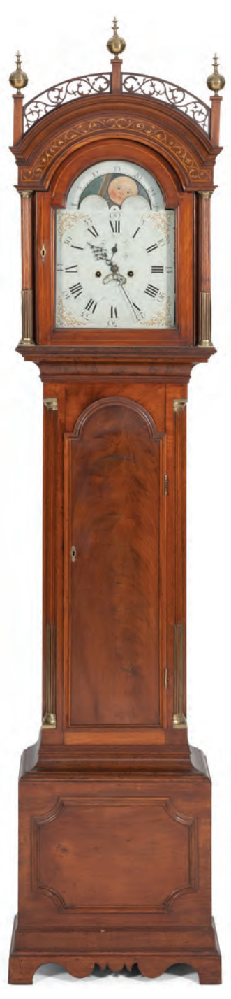
Figure 5. William Fitz tall case clock, signed from Portsmouth, NH, ca. 1795. It recently sold for $68,750.